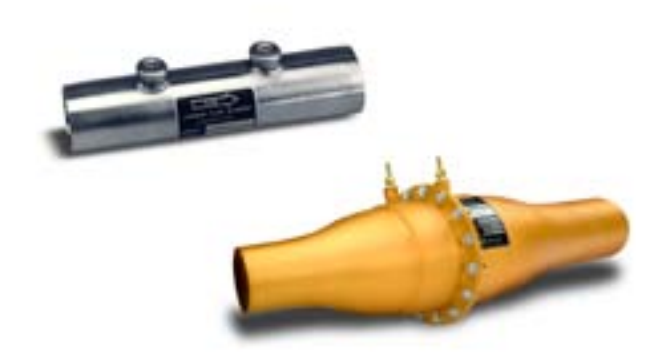
LFEs for hose type process connections

LFEs can be used to measure flow rate for a variety of gases and applications. Standard models are available to measure as little as 0.2 SCCM (5.9 E-06 SCFM) to as much as 2250 SCFM of air flow at standard conditions. Custom models for up to 15,000 SCFM of air are available. Stainless steel or aluminum materials make LFEs compatible with most gases. Flow rate of gas mixtures can also be measured when the percentages of component gases and mixture properties are known.