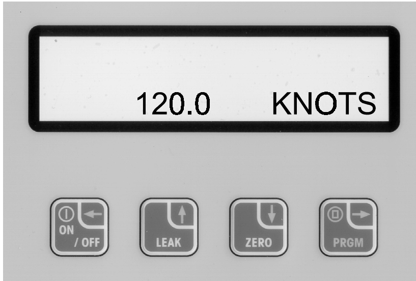
PITOT SIDE DISPLAY AND KEYPAD

The Model 370PSK's Pitot Display provides accurate Airspeed Indication and Pitot System Leak Testing at the stroke of a key. The microprocessor based unit has \pm 0.05\% of full scale accuracy including all effects of linearity, repeatability, hysteresis and temperature over the range of 23° F to 122° F. Airspeed can be displayed in knots, mph, or km/h. Resolution of airspeed units is to the nearest tenth. Other display options include user selectable pressure units of inches of H 2 O, inches of Hg, PSI or millibars. A