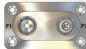
GI, CI, or AI Standard Manifold