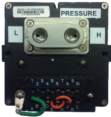
Back of M2110P

Meriam's M2110 Series Smart Gauge is back by popular demand! It features Meriam's new Embedded Pressure Instrument (EPI) for the latest technology while retaining the same enclosure and user interface as the original design. The large display, flexible mounting (Panel, Pipe or Bench top) and power options (24 VDC, Battery or AC) make it the ideal gauge for almost any application. The M2110 features NIST traceable accuracy of \pm 0.05\% F.S., independent of temperature effect, at a very reasonable price.